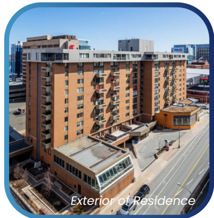
Exterior of Residence